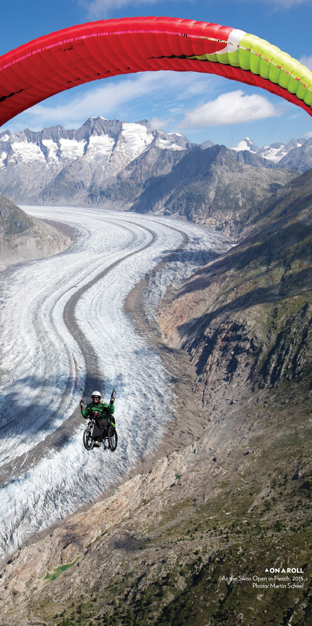
▲ ON A ROLL At the Swiss Open in Fiesch, 2015